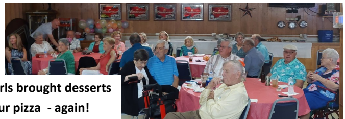
Pat & Lala girls brought desserts to go with our pizza - again!

THIS NEWSLETTER IS PUBLISHED BY THE SLOVENE AMERICAN CLUB FOUR TIMES A YEAR: JANUARY—APRIL—JULY—OCTOBER