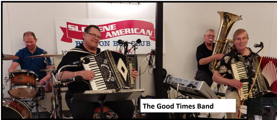
The Good Times Band